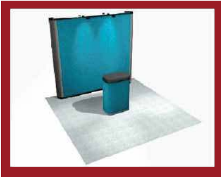
Table Exhibitor (Sample)